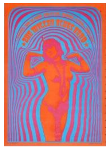
Neon Rose #2 Steve Miller Blues Band

high-water mark of the pure use of color for that era. Moscoso is the master of psychedelic colors and vibrating colors, but always with exquisite taste.