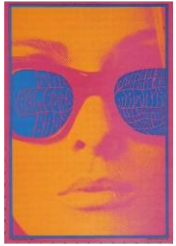
Neon Rose #12 Chambers Brothers

There are few sets of posters as immediately appealing, not just to the collector, but to the whole family. When I began collecting posters, I had to do some fast talking to make it clear to my wife that these things were worth something, worth investing in. When she saw some of the Neon Rose series, she liked them at once and got the message.